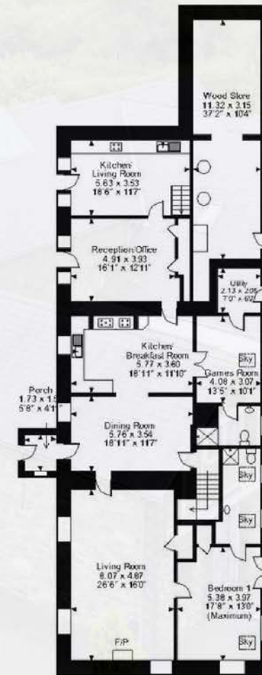
Farm House Ground Floor